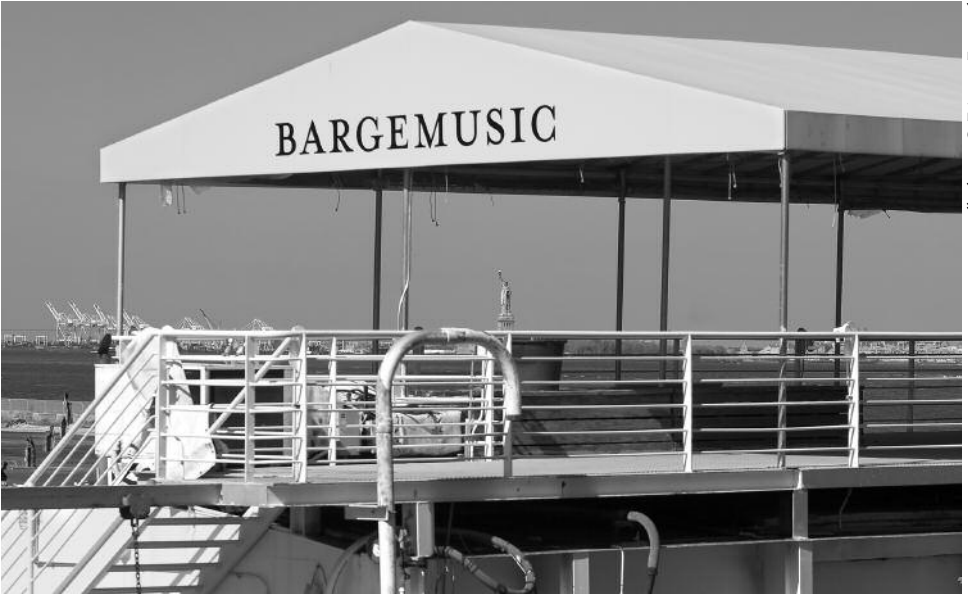
The impressive vistas from Bargemusic, with our newly unobstructed view of the Statue of Liberty.