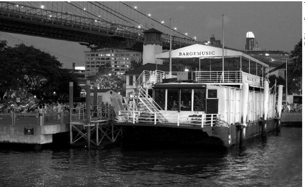
A view of Bargemusic from Pier 1