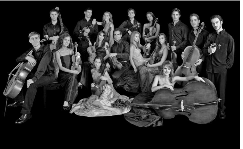
Salomé Chamber Orchestra